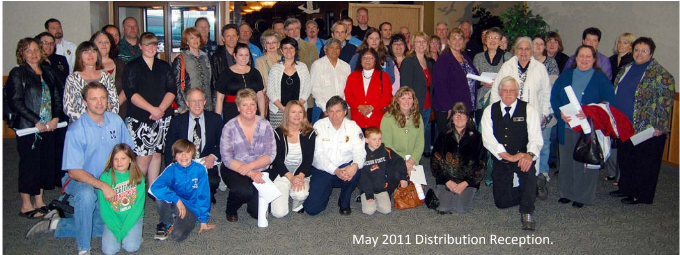
May 2011 Distribution Reception.

The Confederated Tribes of Siletz Indians of Oregon (Siletz Tribe) enacted Ordinance Section 4.20, Distribution of Net Revenues Ordinances on July 6, 1999. Additionally, Siletz Tribes and the State of Oregon signed a Memorandum of Understanding (MOU) on September 4, 1999. Through these two documents, the Charitable Contributions fund and Advisory Board were created.