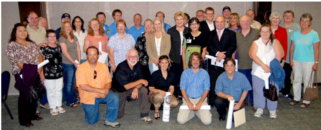
2011 third quarter recipients at the August, 2011 Distribution Reception at Chinook Winds Casino Resort. Tribal Council and Advisory Board members distributed $92,226.40 to 25 organizations.

Once again the Siletz Tribe is happy to report the contributions to the communities within its eleven-county service area and Native American entities or activities within the United States.