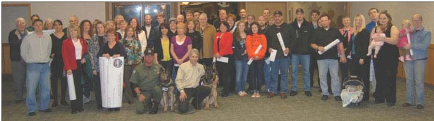
2011 First quarter recipients at the February 4, 2011 Distribution Reception at Chinook Winds Casino Resort. Tribal Council and Advisory Board members distributed $108,327.57 to 34 organizations.