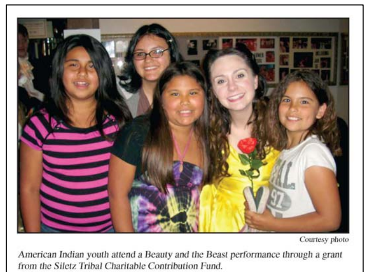
American Indian youth attend a Beauty and the Beast performance through a grant from the Siletz Tribal Charitable Contribution Fund.

The Kamiah Community Partners Coalition (KPC) received $1,035 for Native American Youth Educational Arts Program. Youth benefited from attendance at live performances of Scrooge and Beauty and the Beast in Lewiston, Idaho providing access that otherwise would not be available to them. More than 150 youth benefited from YouthFest which is an innovative way to hold a town hall meeting and a channel through which to deliver a message about alcohol and other substance abuse prevention. This event included fun-filled activities and games for youth and their families.