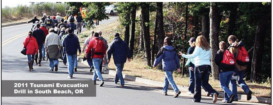
2011 Tsunami Evacuation Drill in South Beach, OR

Receive life-saving emergency information and important public service announcements in minutes. Receive your notification via cell phone, home phone, email, text messaging, fax, pager, PDA and more. Please sign up on-line today!