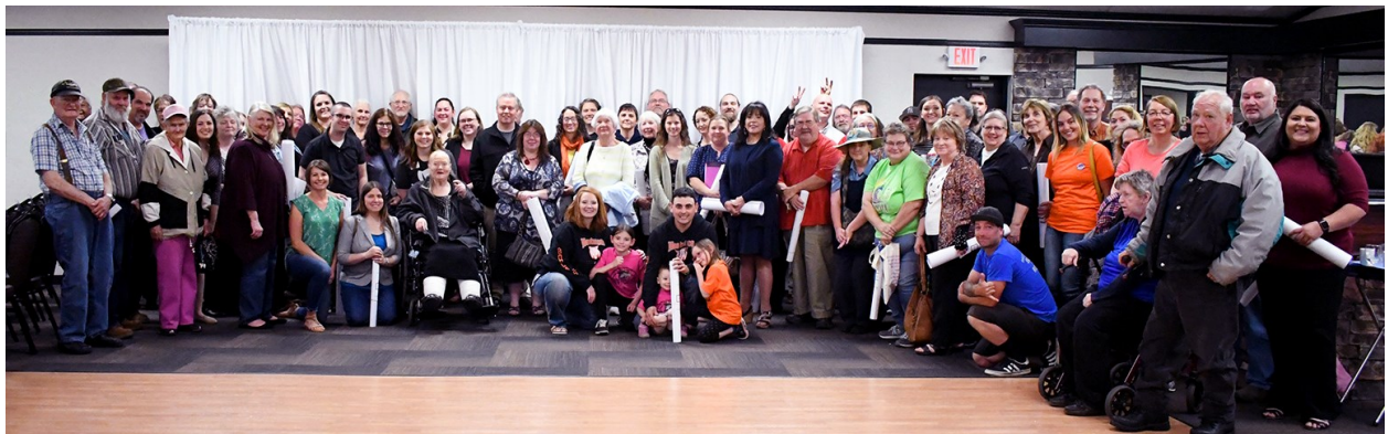
Siletz Charitable Award Reception, May 3, 2019 - Chinook Winds Casino Resort

In 2019 the Siletz Tribal Charitable Contribution Fund received 358 eligible applications and approved 211 awards totaling over $1.3 million dollars. Fifty-nine percent of applicants received assistance.