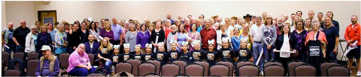
Siletz Charitable Award Reception, August 2, 2019 - Chinook Winds Casino Resort