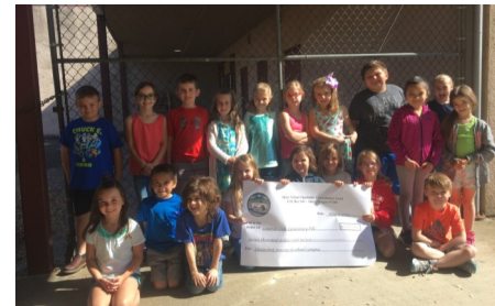
Central Linn Elementary School in Brownsville, OR secured local donations and support from the Siletz Tribe to install chain-link fencing around the school campus and sports fields.