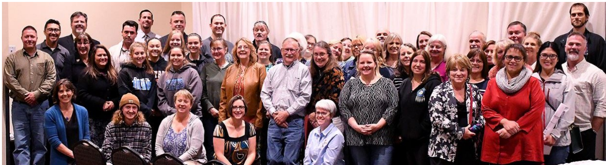
Siletz Charitable Award Reception, November 1, 2019 - Chinook Winds Casino Resort