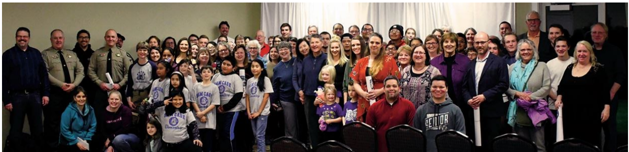
Siletz Charitable Award Reception, February 1, 2019 - Chinook Winds Casino Resort