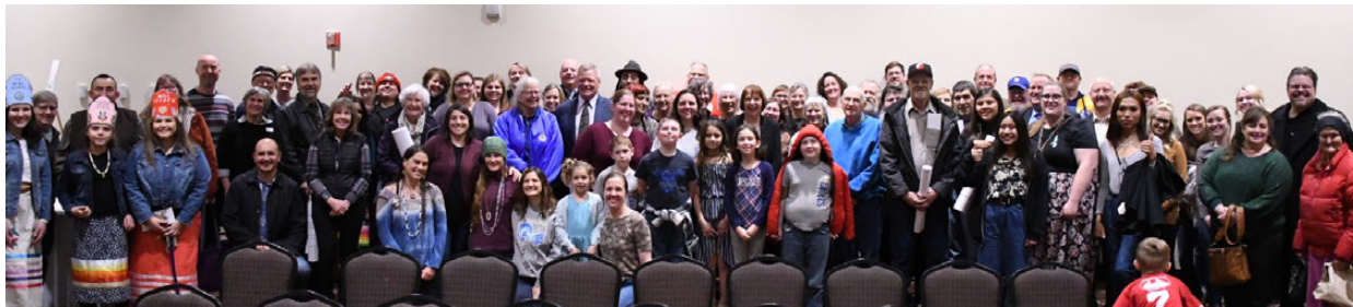
First quarter awardees, February 7, 2020, CWCR

2000-2020 Siletz Tribal Charitable Contribution Fund TWENTY YEARS OF GIVING